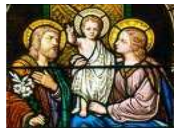
Our Holy Family

As caretakers of the faith community begun here 95 years ago, our parishioners respond to the call to service. Whether as Lectors, Ministers of Communion, Helping Hands, Knights of Columbus, or Women's Club members, there are many places to serve, learn, teach, and grow at Holy Saviour. We always welcome new parishioners because there is always a place for everyone within our parish family.